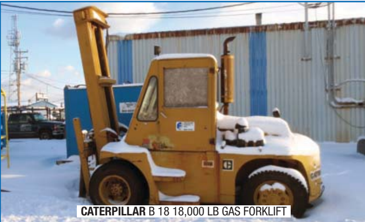
CATERPILLAR B 18 18,000 LB GAS FORKLIFT