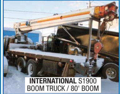
INTERNATIONAL S1900 BOOM TRUCK / 80' BOOM