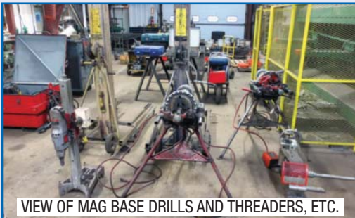
VIEW OF MAG BASE DRILLS AND THREADERS, ETC.