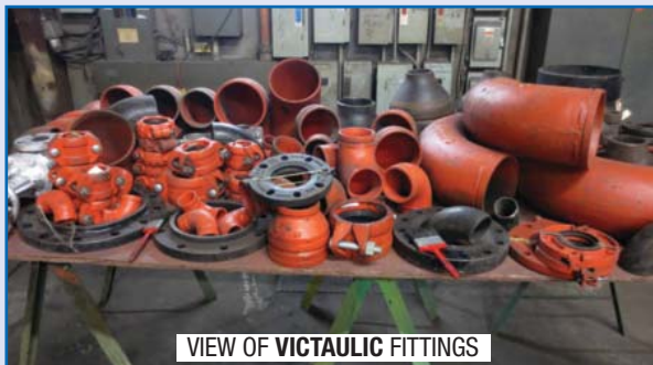
VIEW OF VICTAULIC FITTINGS