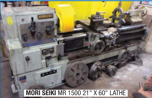
MORI SEIKI MR 1500 21" X 60" LATHE