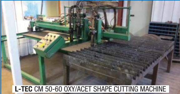
L-TEC CM 50-60 OXY/ACET SHAPE CUTTING MACHINE