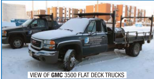
VIEW OF GMC 3500 FLAT DECK TRUCKS