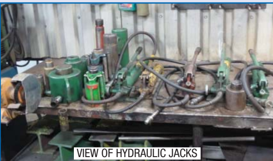
VIEW OF HYDRAULIC JACKS