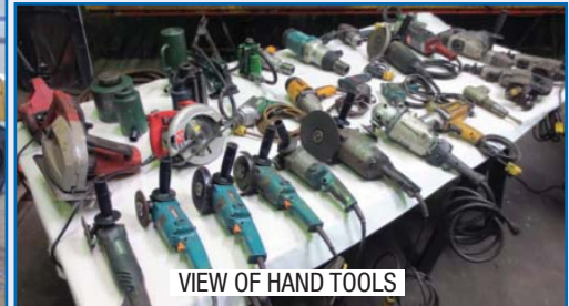
VIEW OF HAND TOOLS

ONLINE ONLY: ENDS Jan. 21 st 1:00 PM (ET) Bid Online Via BidSpotter.com