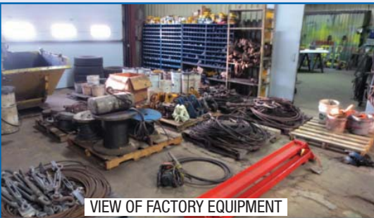
VIEW OF FACTORY EQUIPMENT