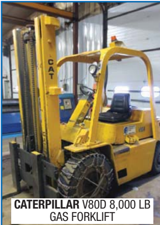
CATERPILLAR V80D 8,000 LB GAS FORKLIFT

ONLINE ONLY: ENDS Jan. 21 st 1:00 PM (ET) Bid Online Via BidSpotter.com