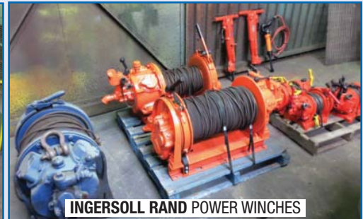
INGERSOLL RAND POWER WINCHES