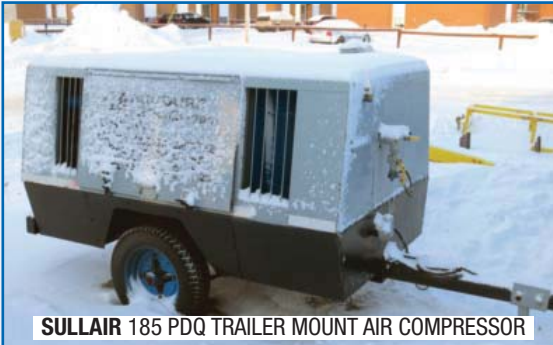
SULLAIR 185 PDQ TRAILER MOUNT AIR COMPRESSOR