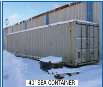
40' SEA CONTAINER

Partial Listing Only. For More Photos, Specs, Registration, Complete Terms & Conditions, Removal Times, Please Visit infinityassets.com For Details.