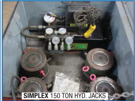
SIMPLEX 150 TON HYD. JACKS