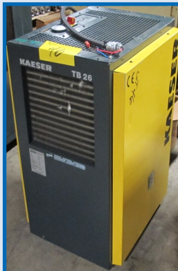
KAESER TB 26 DRYER

Loading Fees Apply, See Website For Details