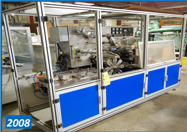
SASIB ALFA SOFT PACKAGING LINE