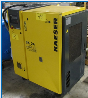
KAESER SK 24 COMPRESSOR