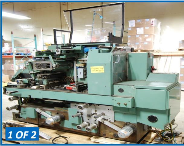
TDC MD-820, HFP-920 SHISHA PACKER LINE