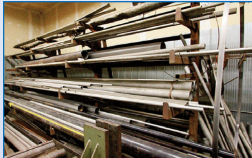
PARTIAL VIEW OF S/S PIPE & INVENTORY