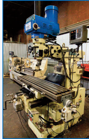
DARBERT VERTICAL MILL