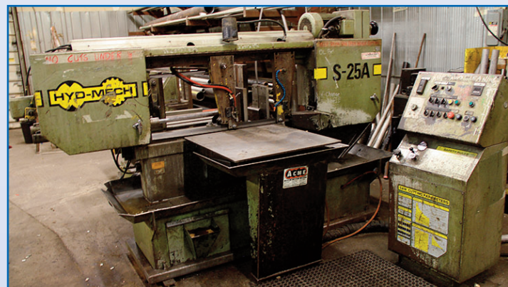
HYD-MECH S23-A AUTO HYDRAULIC BANDSAW