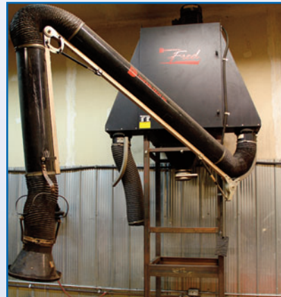
DIVERSI-TECH FUME EXTRACTORS