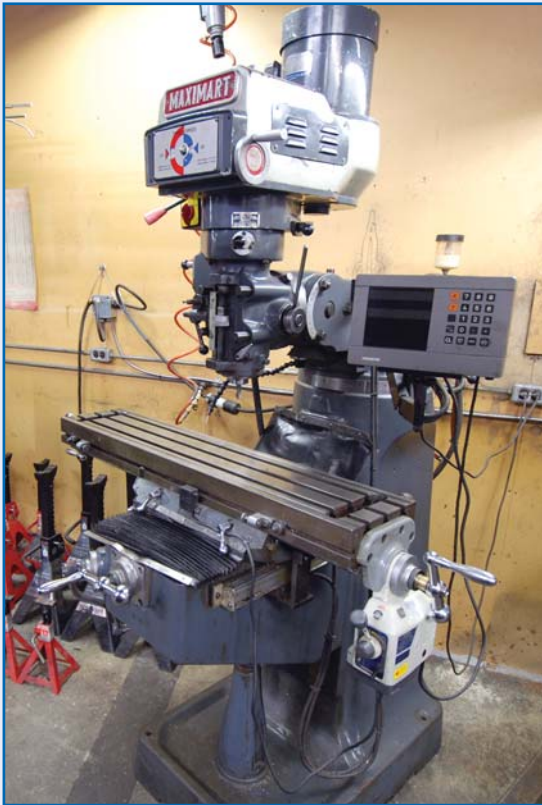
MAXIMART VERTICAL MILL