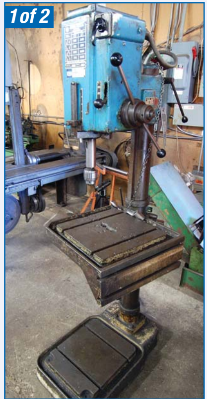
SOLBERGA GEARED HEAD DRILL