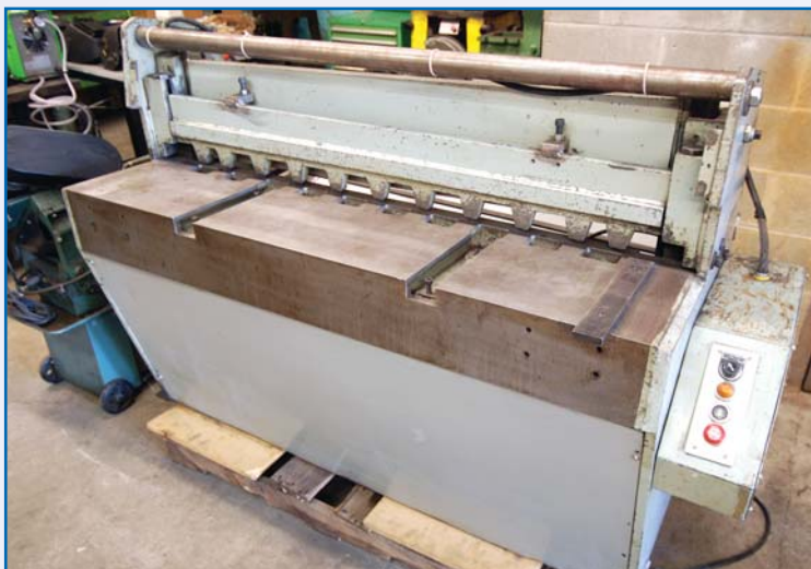
EDWARDS 4' POWER SHEAR, MODEL 3.25