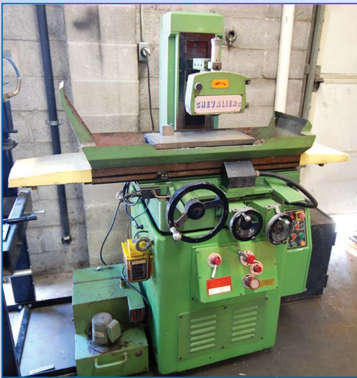
CHEVALIER MODEL II, 8"X18" SURFACE GRINDER