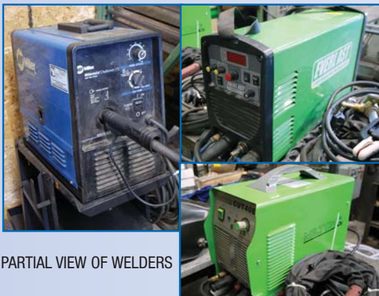
PARTIAL VIEW OF WELDERS