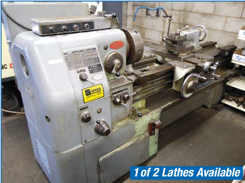
1 of 2 Lathes Available