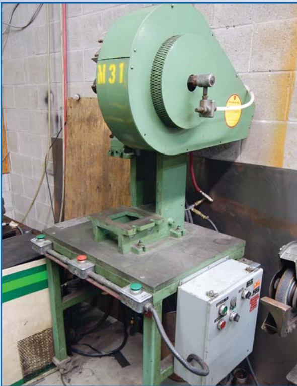
BENCHMASTER 10 TON PRESS MODEL 201 AX