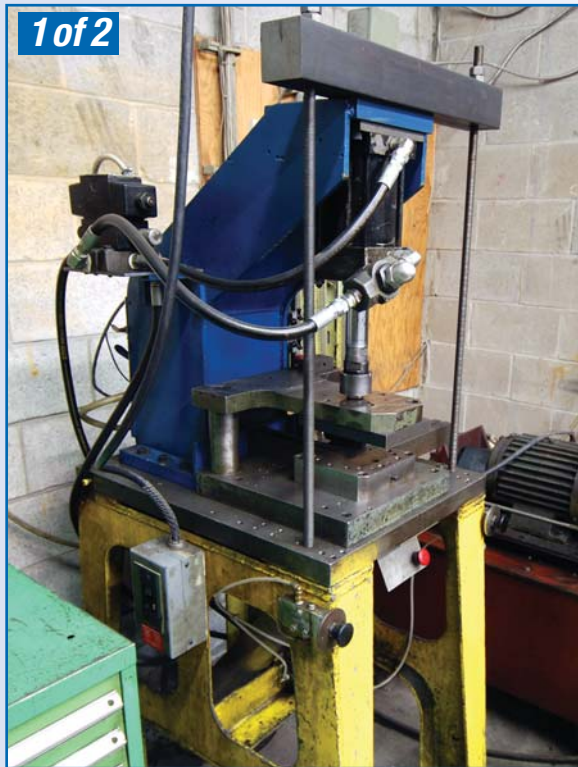
CUSTOM HYDRAULIC PRESS