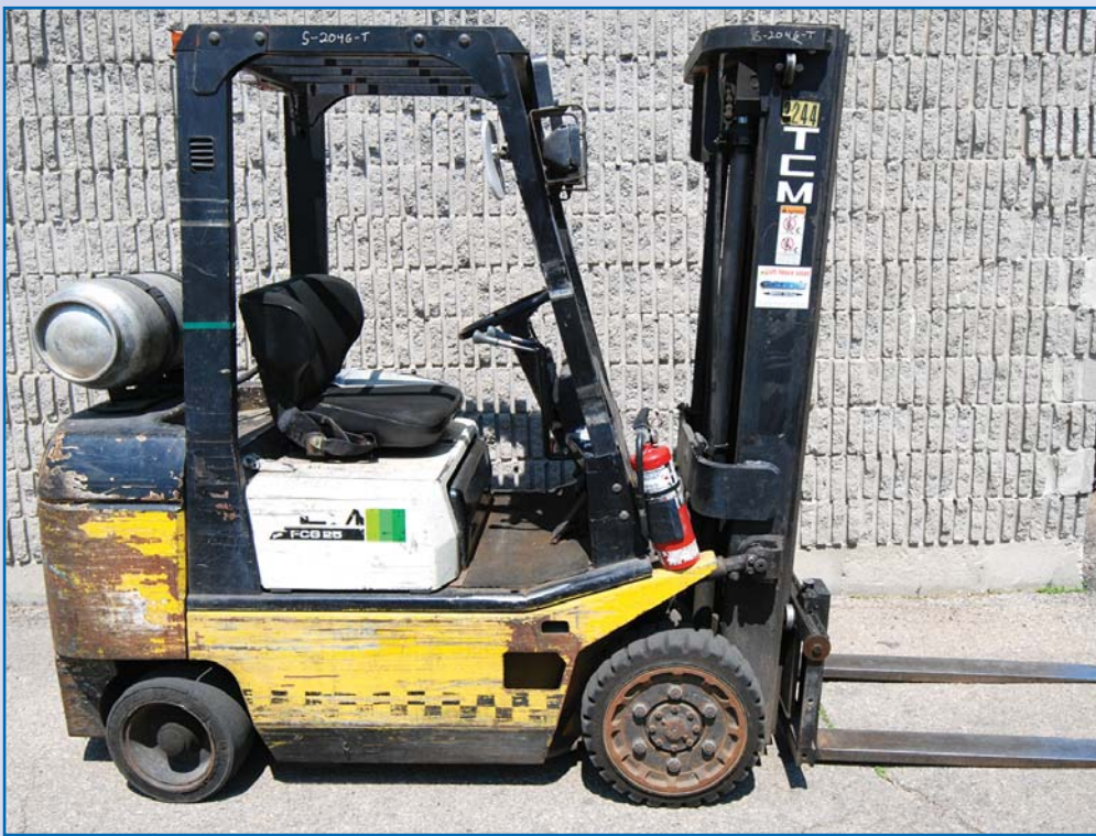
TCM 5,000 LB LPG FORKLIFT