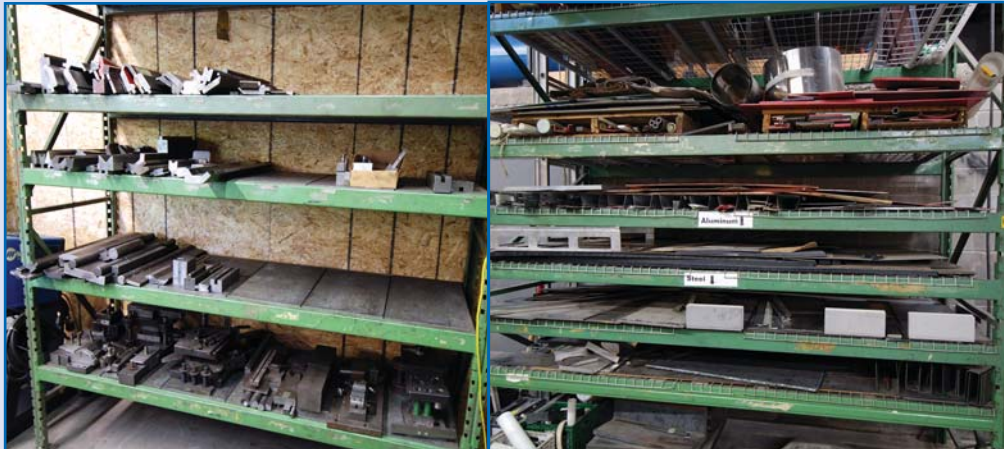
PARTIAL VIEW OF SUPPORT EQUIPMENT