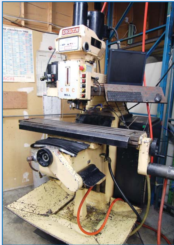
DELTA CNC MILL MODEL VH 3600