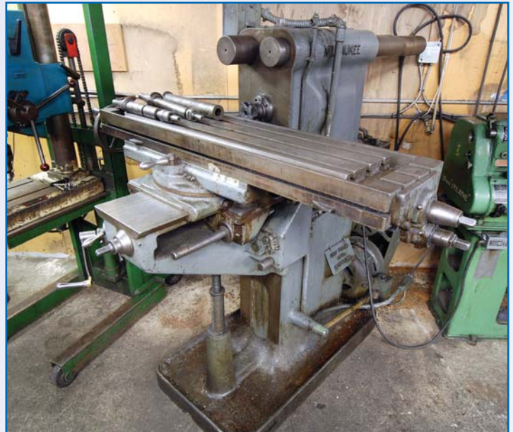
MILWAUKEE NO 1-1/2B HORIZONTAL MILL