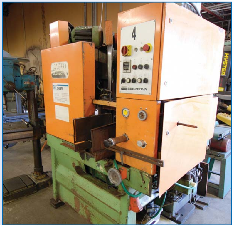
KASTO VERTICAL BANDSAW MODEL SSB260VA