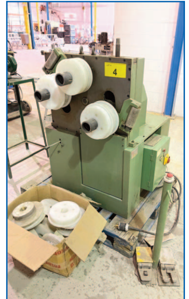
COMAC 50ALH BENDING ROLLS