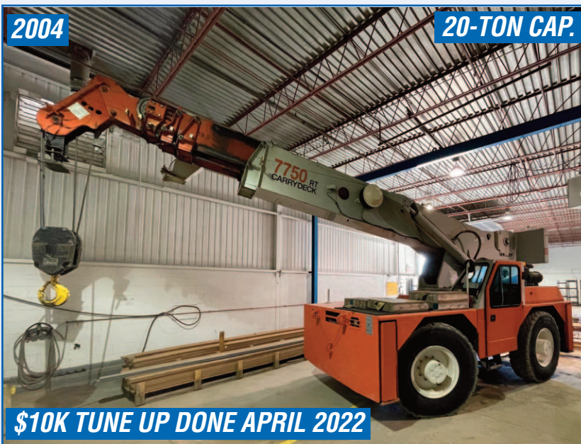
SHUTTLELIFT 7750RT CARRY DECK MOBILE BOOM CRANE