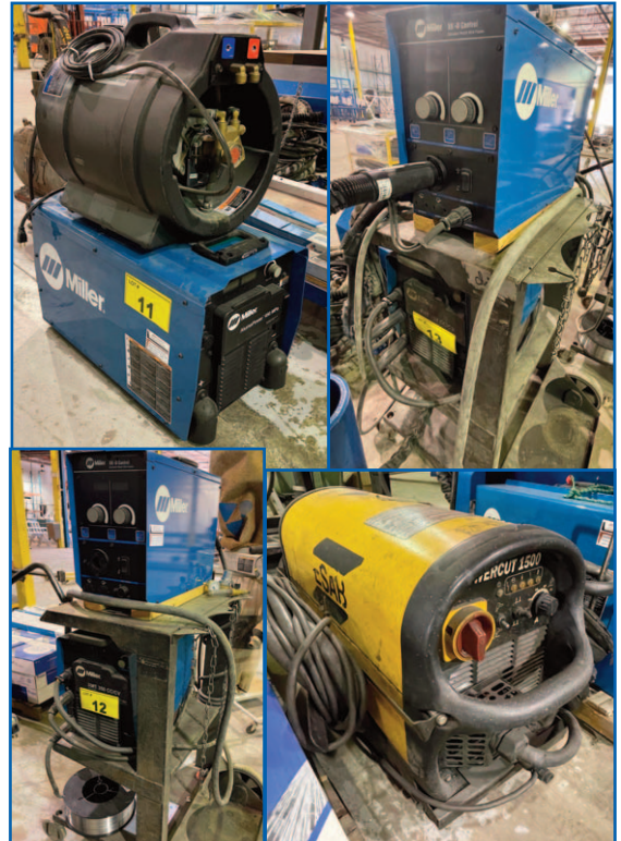
PARTIAL VIEW OF WELDERS