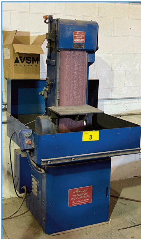
HAMMOND 1000-VV VERTICAL ABRASIVE WET BELT GRINDER