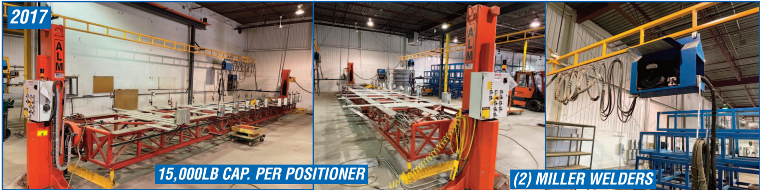
ALM MHL-2P WELDING POSITIONER SYSTEM