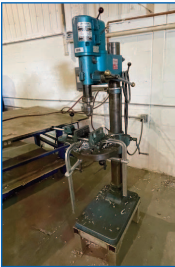
NIDER NI-64/E-2 DRILL PRESS