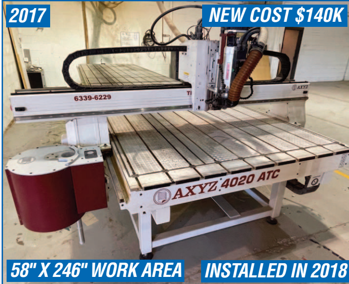
XYZ 4020 ATC CNC ROUTER