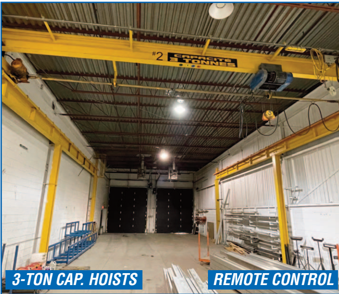
3-TON CAP. HOISTS