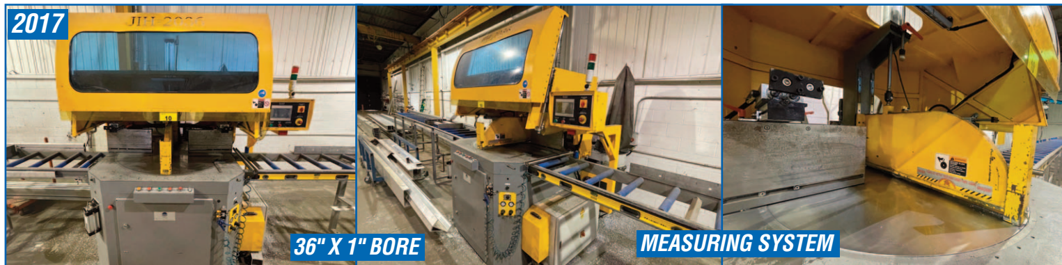
PMI-20-36 PRECISION ALUMINUM UPCUT SAWING SYSTEM

2017 XYZ 4020 ATC CNC router system with 58" X 246" working area, 10.8HP spindle, VORTEX cold gun, Auto zone and squaring, BUSCH Mink MM 1252 AV Vacuum pump, s/n MQU6339-6229, Paid $115K, installed 2018