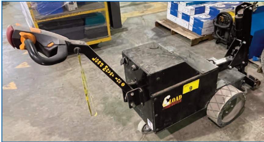
LOADMOVER INVENTORY TRANSPORTER