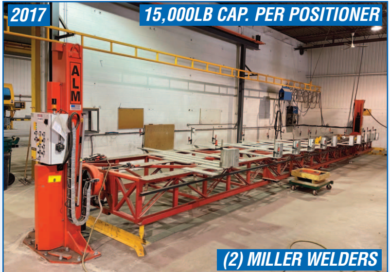
ALM MHL-2P WELDING POSITIONER SYSTEM