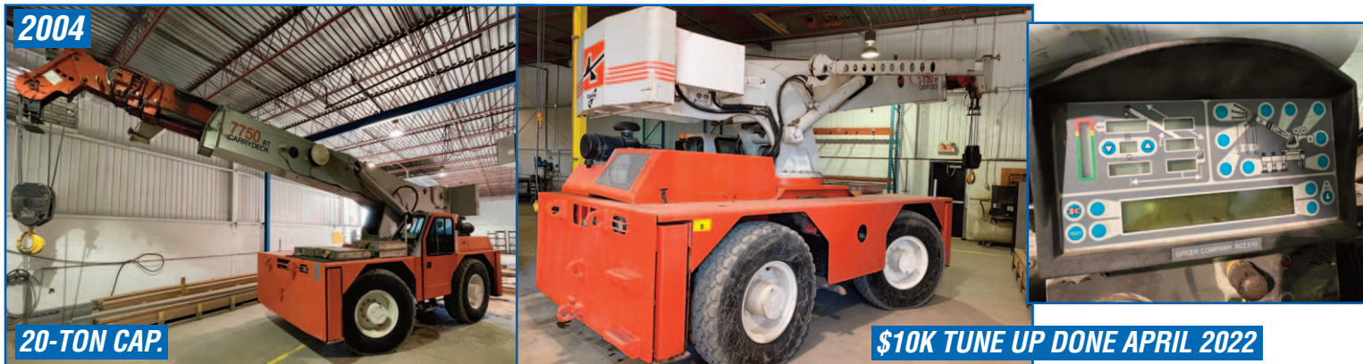
SHUTTLELIFT 7750RT CARRY DECK MOBILE BOOM CRANE