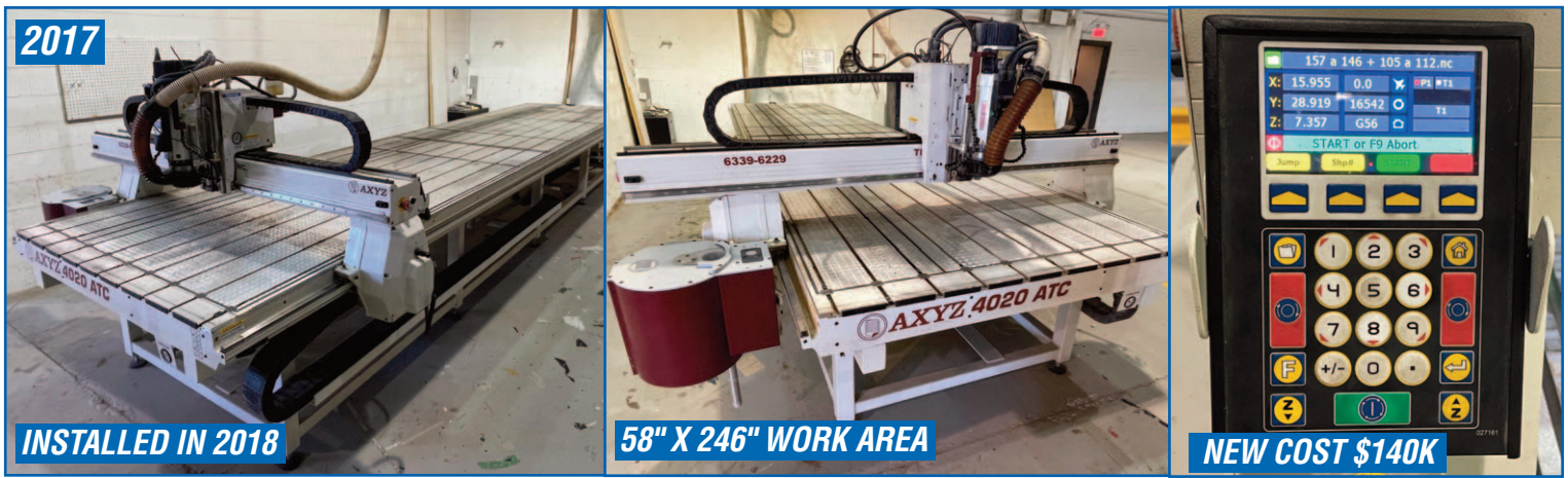
XYZ 4020 ATC CNC ROUTER