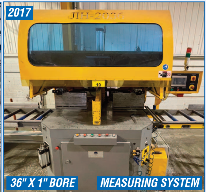
PMI-20-36 PRECISION ALUMINUM UPCUT SAWING SYSTEM

CLOSES: Tuesday October 18 th , 11:00 AM (ET)