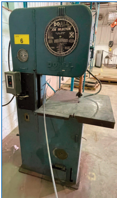
DOALL ML VERTICAL BAND SAW