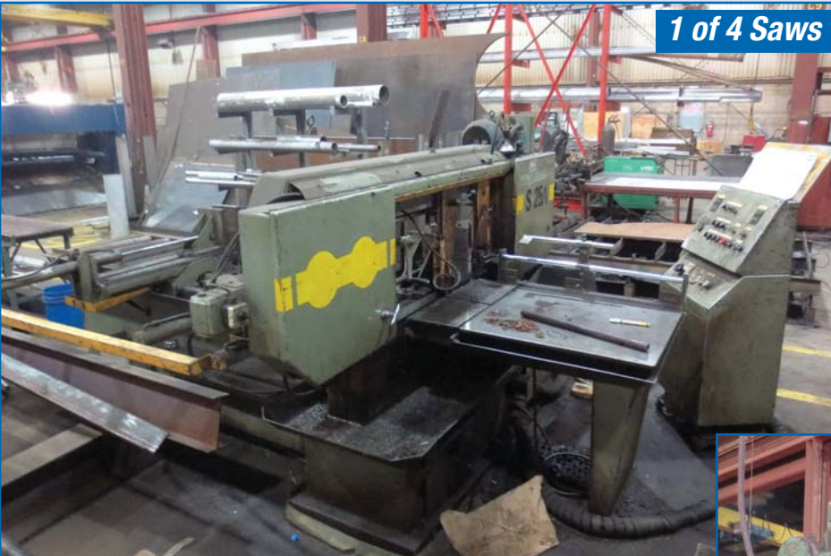
HYD-MECH S-25A Automatic Bandsaw