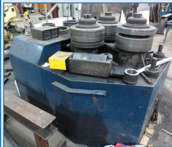
PULLMAX Angle Rolls, Model Z43, 6" x 6" x 1/2"

Also Featuring: 10 Overhead Cranes, 50', Up To 20 Ton