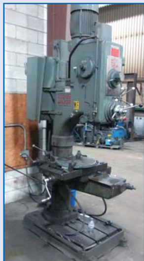
KITCHEN WALKER V2 Gear Head Drill Press