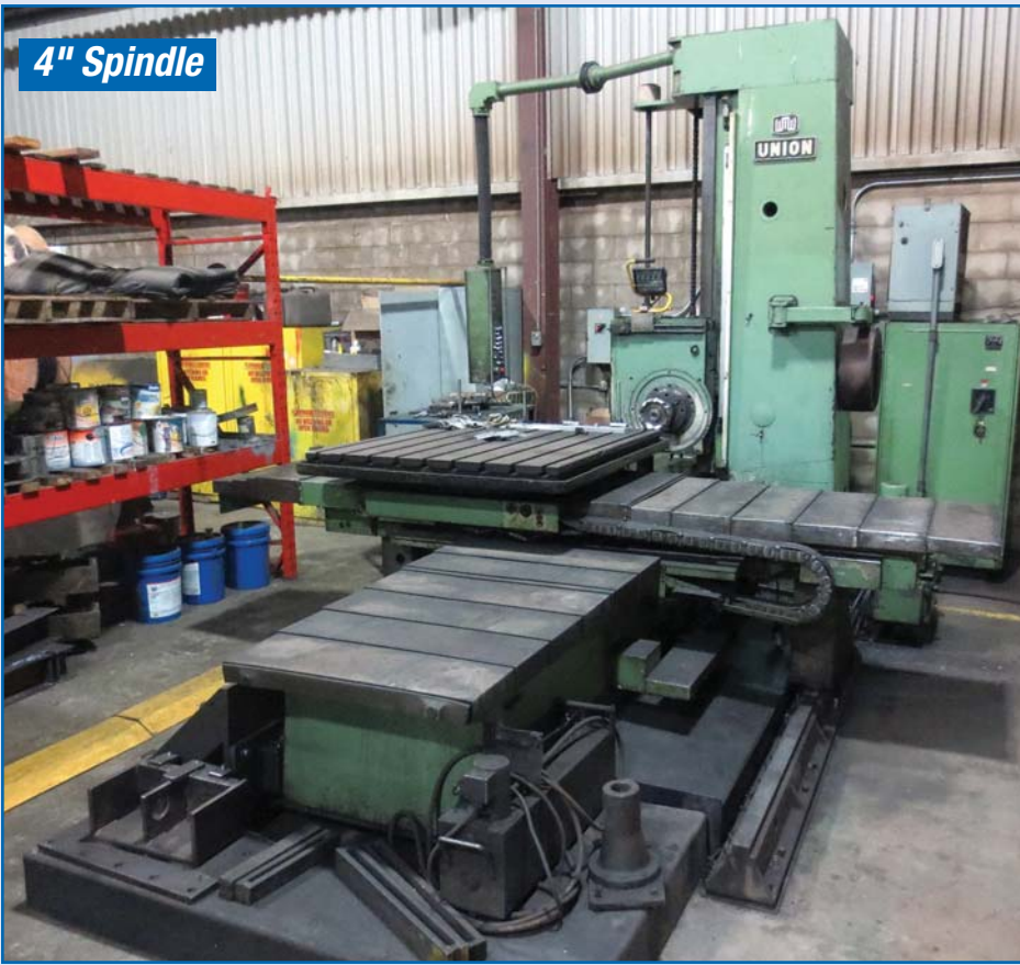
UNION 4" Horizontal Boring Mill, Model BFT-102