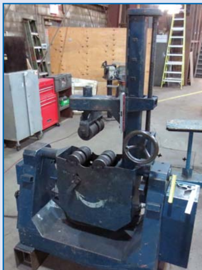
KISTLER PIPE Positioner