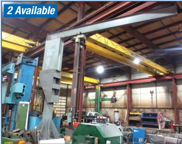
1 Ton Jib Crane, Approx 16' Jib x 18'