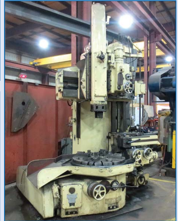
BERTHIEZ IR9320/3 Vertical Boring Mill