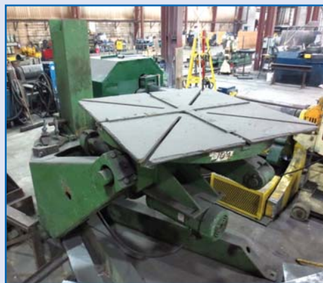
IRCO 7.5T PRUT Weld Positioner