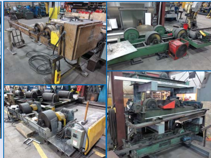
Partial View of 22 Sets of Heavy Duty Tank Turning Rolls

(2) MILLER CP-302 300 Amp DC Power Supply, Cobramatic Wire Feeder, Coolmate Water Cooler, sn LF410942C, 34397, sn KH488807