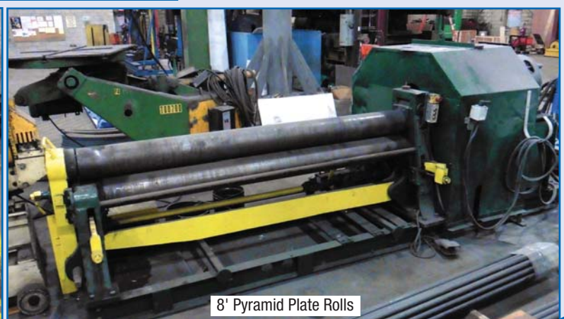
8' Pyramid Plate Rolls