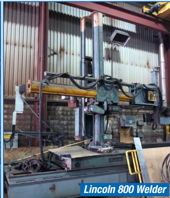
CAMTRON Welding Manipulator