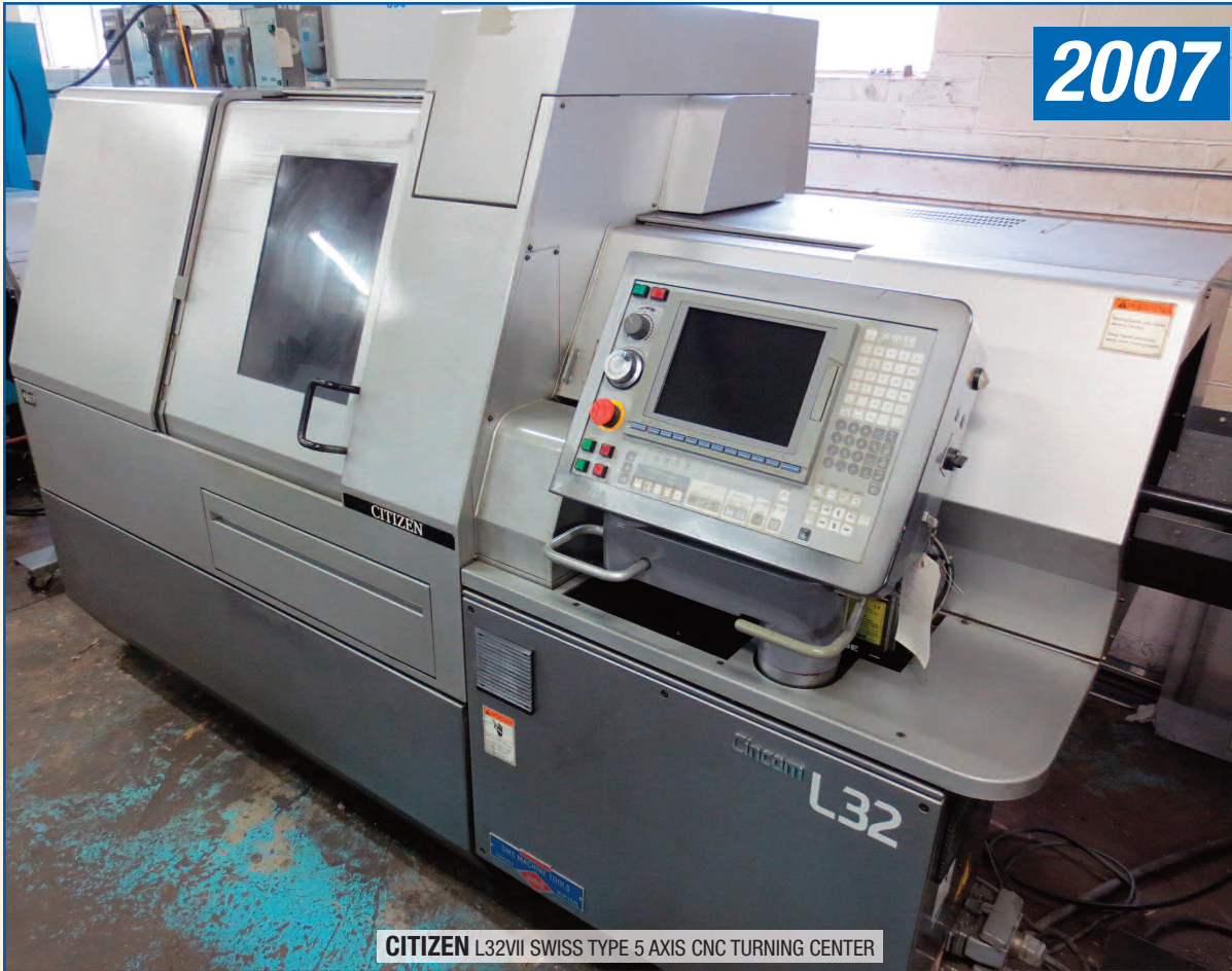
CITIZEN L32VII SWISS TYPE 5 AXIS CNC TURNING CENTER