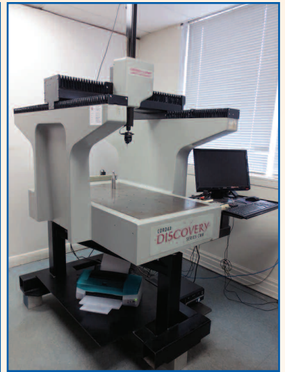
GIDDINGS & LEWIS MODEL D-12 CMM