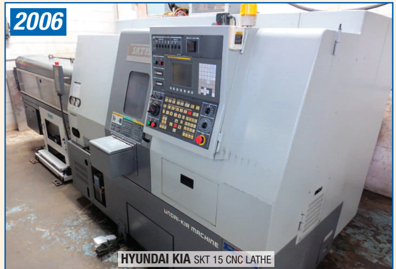
HYUNDAI KIA SKT 15 CNC LATHE