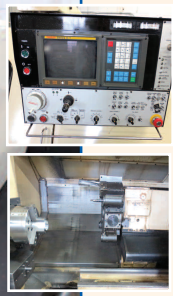
TECHNO WASINO MODEL LJ10 CNC LATHE