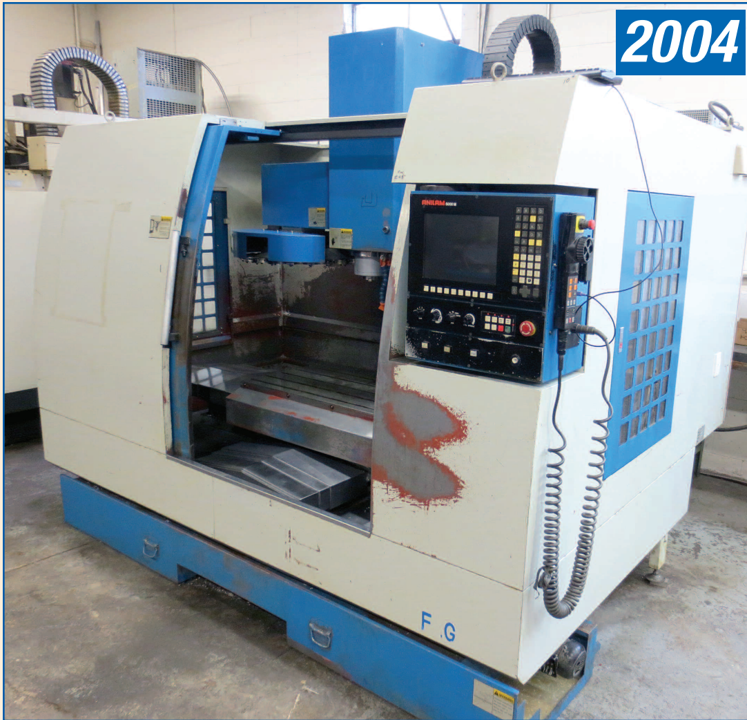
H.H. ROBERTS MODEL FLG 30 CNC VERTICAL MACHINING CENTER