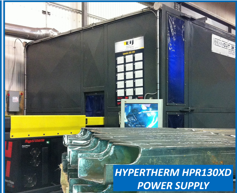
HYPERTHERM HPR130XD POWER SUPPLY

MACHITECH BEAMCUT 360 ROBOTIC PLASMA CUTTING SYSTEM