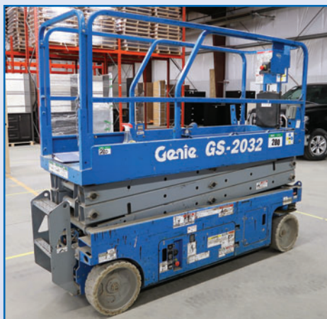
GENIE GS-2032 ELECTRIC SCISSOR LIFT