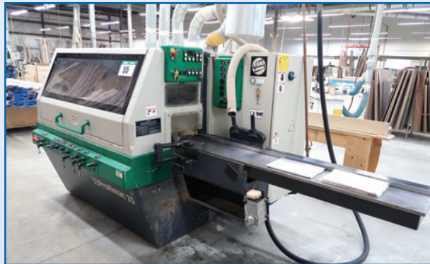
WEINIG PROFIMAT 23 - 5 SPINDLE MOULDER