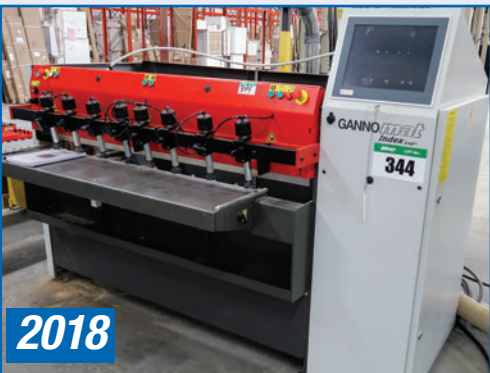
GANNER GANNOMAT TYPE 47IL130 INDEX LOGIC CNC DRILLING/GLUING/DOWEL INSERTING MACHINE