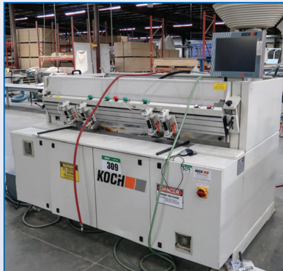
KOCH SPRINT-PTP-2 CNC DRILLING/GLUING/DOWEL INSERTING MACHINE