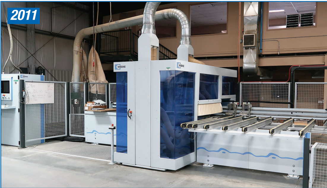
WEEKE OPTIMAT BHX500 CNC MACHINING CENTER