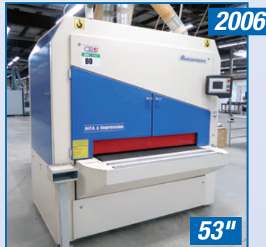
HEESEMANN MFA6-IMPRESSON BELT SANDER