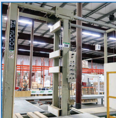
UHLING HP3000 CASE CLAMP