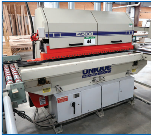
UNIQUE 4522 SHAPE/SAND MACHINE W/ TIGER STOP