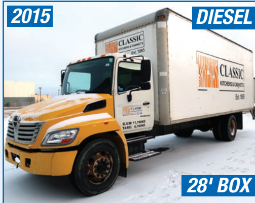
HINO 268 VAN TRUCK