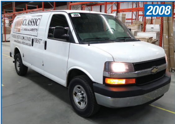
CHEVROLET EXPRESS CARGO VAN