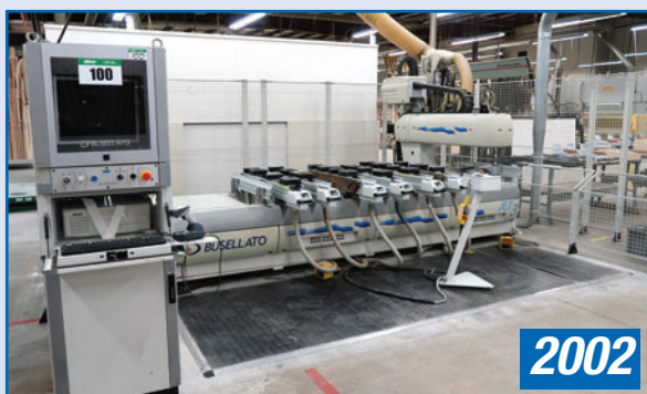
BUSELLATO JET 3 CNC ROUTER