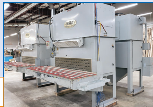
(4) DENRAY DOVENDRAFT TABLES