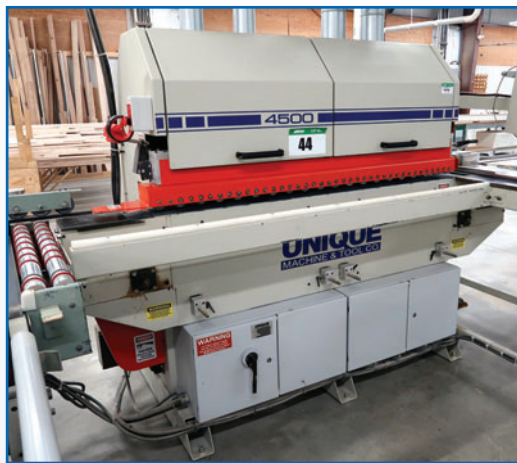
UNIQUE 4522 SHAPE/SAND MACHINE W/ TIGER STOP