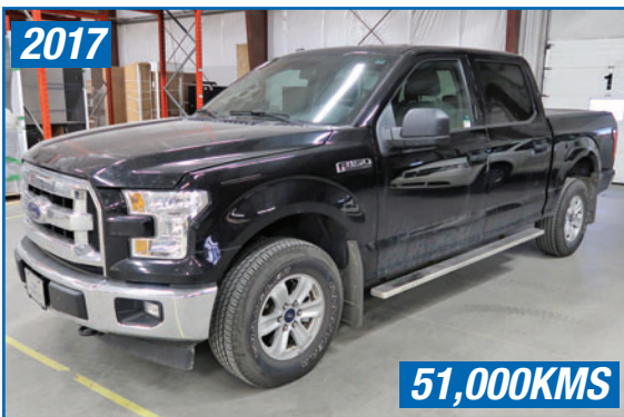
FORD F150 XLT SUPERCREW PICKUP TRUCK