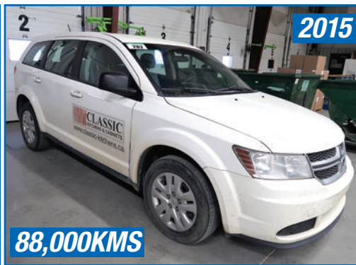
DODGE JOURNEY SUV