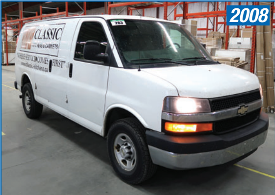
CHEVROLET EXPRESS CARGO VAN