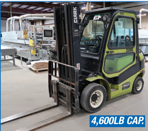
CLARK C25L PROPANE FORKLIFT