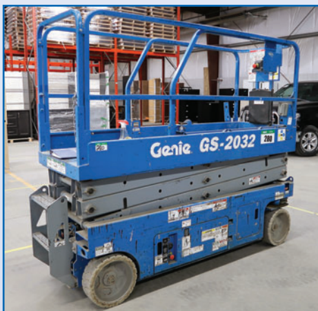
GENIE GS-2032 ELECTRIC SCISSOR LIFT