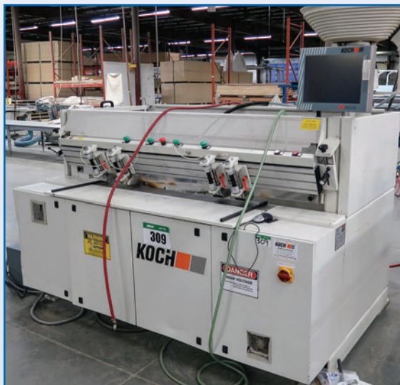
KOCH SPRINT-PTP-2 CNC DRILLING/GLUING/DOWEL INSERTING MACHINE

This brochure is meant merely as a guide. Infinity Asset Solutions makes no guarantee, expressed or implied, as to the accuracy of the information in this brochure. Buyers should inspect the goods beforehand to satisfy themselves.