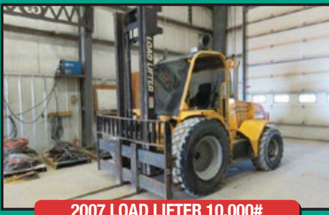
2007 LOAD LIFTER 10,000#