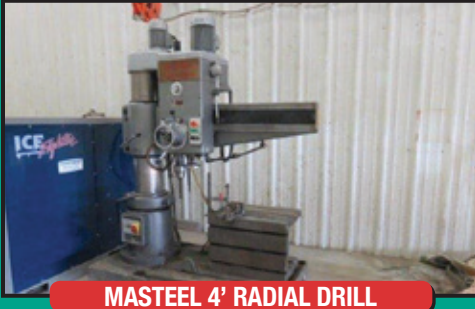
MASTEEL 4' RADIAL DRILL