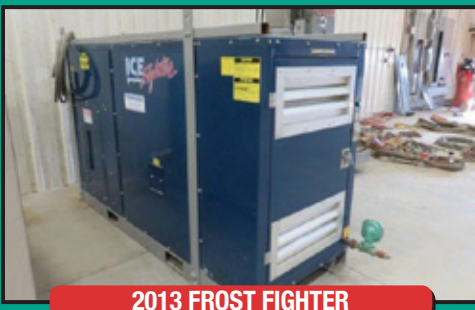
2013 FROST FIGHTER