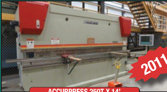
2011 ACCURPRESS 250T X 14'

PLACE: 19 29339 Hwy 2A, Crossfield, Alberta, Canada • PREVIEW: Mon., July 31st - 9am to 4 pm