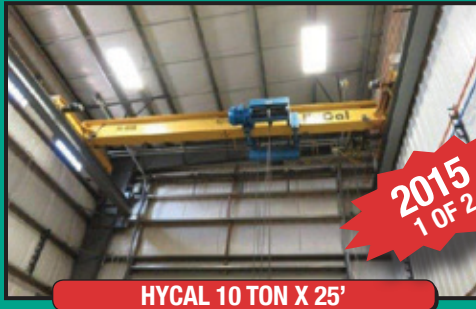
HYCAL 10 TON X 25'