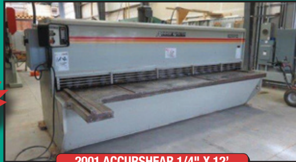
2001 ACCURSHEAR 1/4" X 12'