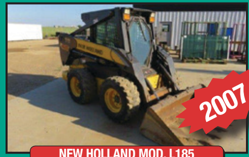
NEW HOLLAND MOD. L185