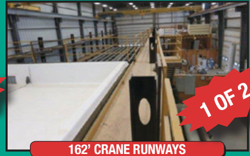
162' CRANE RUNWAYS