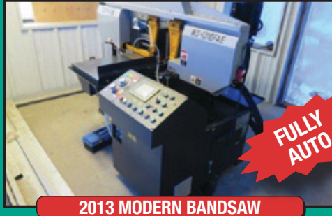
2013 MODERN BANDSAW