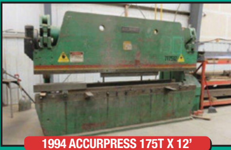
1994 ACCURPRESS 175T X 12'