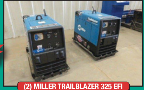
(2) MILLER TRAILBLAZER 325 EFI