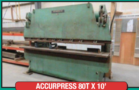
ACCURPRESS 80T X 10'