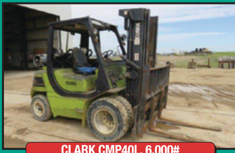
CLARK CMP40L, 6,000#