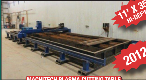
11' X 35' HI-DEFN 2012 MACHITECH PLASMA CUTTING TABLE