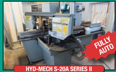
HYD-MECH S-20A SERIES II