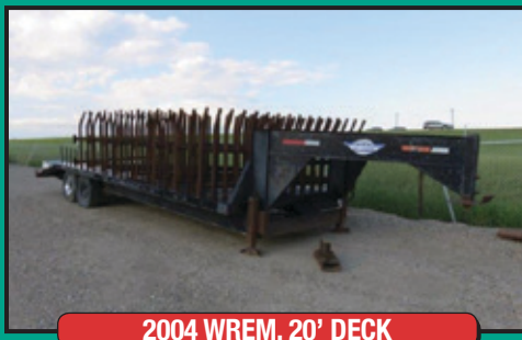
2004 WREM, 20' DECK